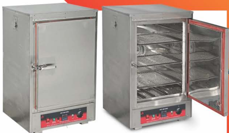
Hot Air Oven (S.S.)

D : Digital | T : Thermostatic | G : GMP | P : Powder coating Note : Customized sizes are also available